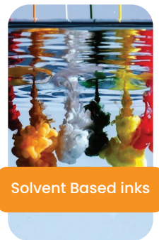
Solvent Based inks