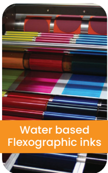
Water based Flexographic inks

Also, the company has significant market presence within Africa, Middle East and Some European countries.